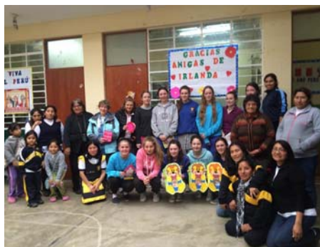
Photo: Teresian volunteers with the teachers and pupils of the Maria Clodilde School

joyed a weekend away in Luanahuana, Huacachina and Paracas (south of Lima). We experienced a range of new