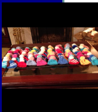
Small Hats for Peru

This summer eleven Fifth Years are travelling to Peru to volunteer with the Teresian programme over there. It's essential for us to fundraise so we can have money to bring over with us to aid the community. We will be holding fundraising events and activities throughout the year within and outside the school. The first of these is already underway. We are selling little handmade hats for use on bottles, as egg cosies or Christmas decorations, for €2. All proceeds from this will go to Peru.