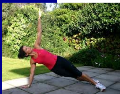
Timely CPR saves lives

talk was reflected in the amount of ques-